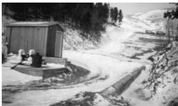
A new seepage collection facility to intercept contaminated groundwater from a waste rock pile at the Zortman Mine

The Little Rocky Mountains are one of several isolated mountain ranges that rise out of the plains in northeast Montana. Called the “Island Mountains” because of their relative isolation from the main chain of the Rockies, the mountains were