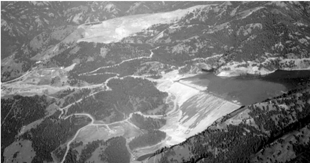
Tailings Pond and Dam (Foreground) and Pit and Mill at the Thompson Creek Mine, a molybdenum mine near Clayton, Idaho. Streaks on the dam face are tailings being deposited on the dam face to raise the level of the dam.