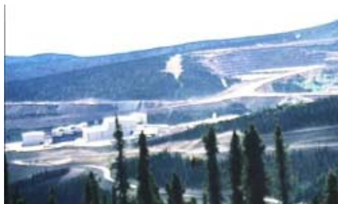
The Fort Knox mill (lower left) and open pit mine (upper right) near Fairbanks, Alaska

The property is currently in an advanced exploration stage. Since this is an underground prospect, this means driving an adit (tunnel) into the mountain to test the competency of the rock for underground mining, and to provide access to the