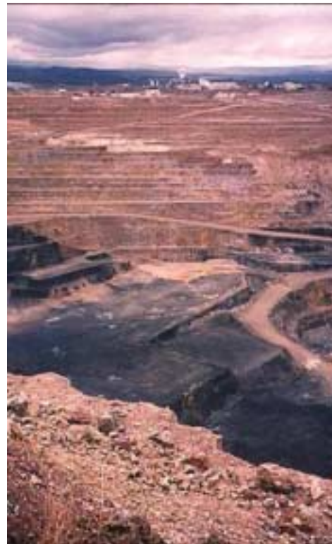
Gold Quarry open-pit gold mine near Carlin, Nevada

Because two of the mines are currently operating and are in a gold bearing trend that has produced gold for decades, it is very unlikely that these projects can be stopped for environmental reasons. The no action alternative in these projects is a severely mined mountain range. Mitigation must include strategies to minimize the damage from the