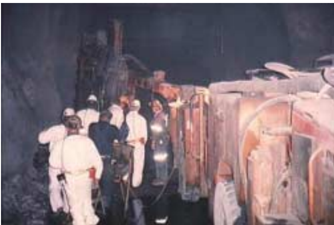
Underground drilling equipment in the Meikle Mine, one of America's richest gold mines, near Carlin, Nevada.

Whether land management agencies have a responsibility to bond for an impact that has a low probability of occurrence - but a high cost if it occurs - and establishing an appropriate amount for such a bond is a major policy issue being considered in this work. The chosen methodology may set precedence for large-scale mining elsewhere.