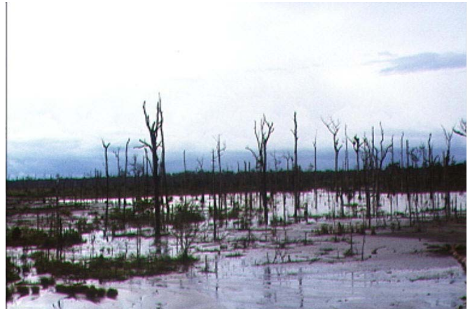
Dying trees caused by riverine waste disposal at the Ok Tedi Mine, Papua New Guinea

mining project. Many countries in the developing world have environmental laws that are similar, even modeled on, environmental laws in the United States. This is the case in Chile, Laos, and Papua New Guinea. However, what these countries almost always lack is: (1) the political will to enforce these laws; and, (2) available technical expertise to provide meaningful enforcement.