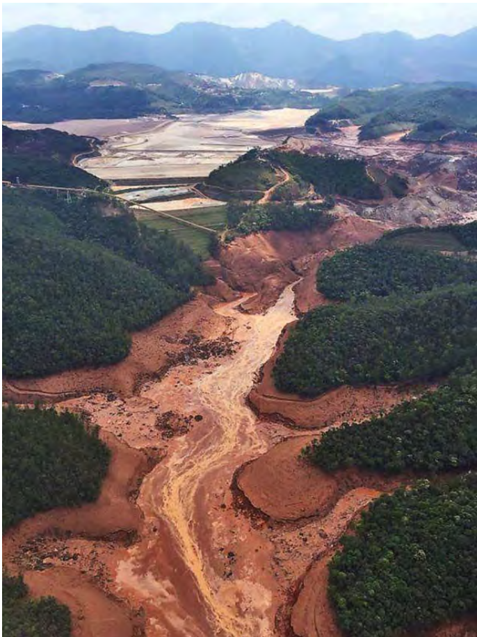
Fundao Tailings Dam Failure, Brazil, November 2016

As a result of our research, we now have the most complete publically available database of tailings dam failures, which is posted on the CSP 2 website. We are not aware of any better data sources, although they could exist in the private sector. Our database is comprised of information available on the web. CSP 2 does not have the resources to get data from regional regulators, if they have it and will release it, but someone should compile this information. Regulators may not want to release, or even collect, this information because it essentially documents regulatory failures. Nonetheless, without this information