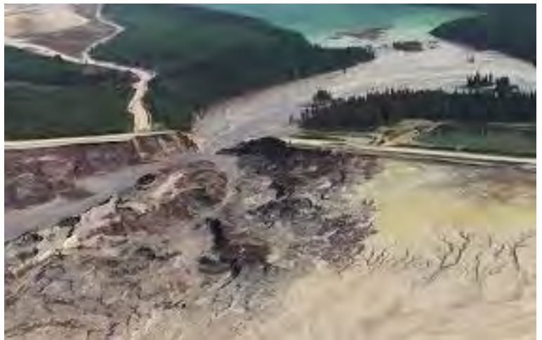
Mt Polley Tailings Dam Failure, British Columbia, August 2014

are. This information may exist somewhere in a government file, perhaps in British Columbia and Nevada, but it does not exist at any national or the international level. This is alarming because tailings dam failures can cause billions of dollars in damage, as a recent failure in Brazil had demonstrated, but no national (e.g. the USEPA) or international body (e.g. the International Commission on Large Dams, or the United Nations Environmental Programme) deems it necessary to determine how this is happening, and how to prevent it.